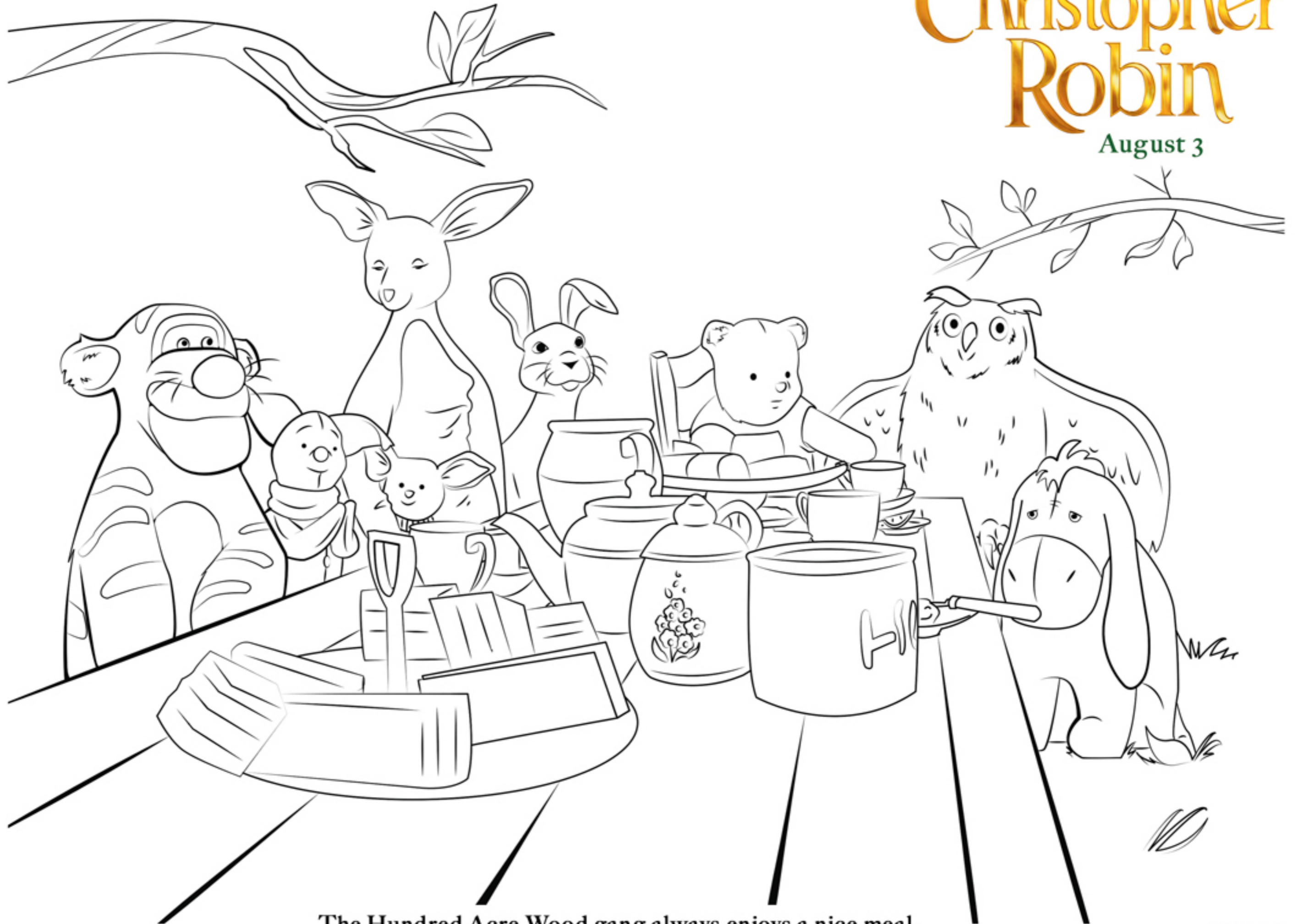
The Hundred Acre Wood gang always enjoys a nice meal.