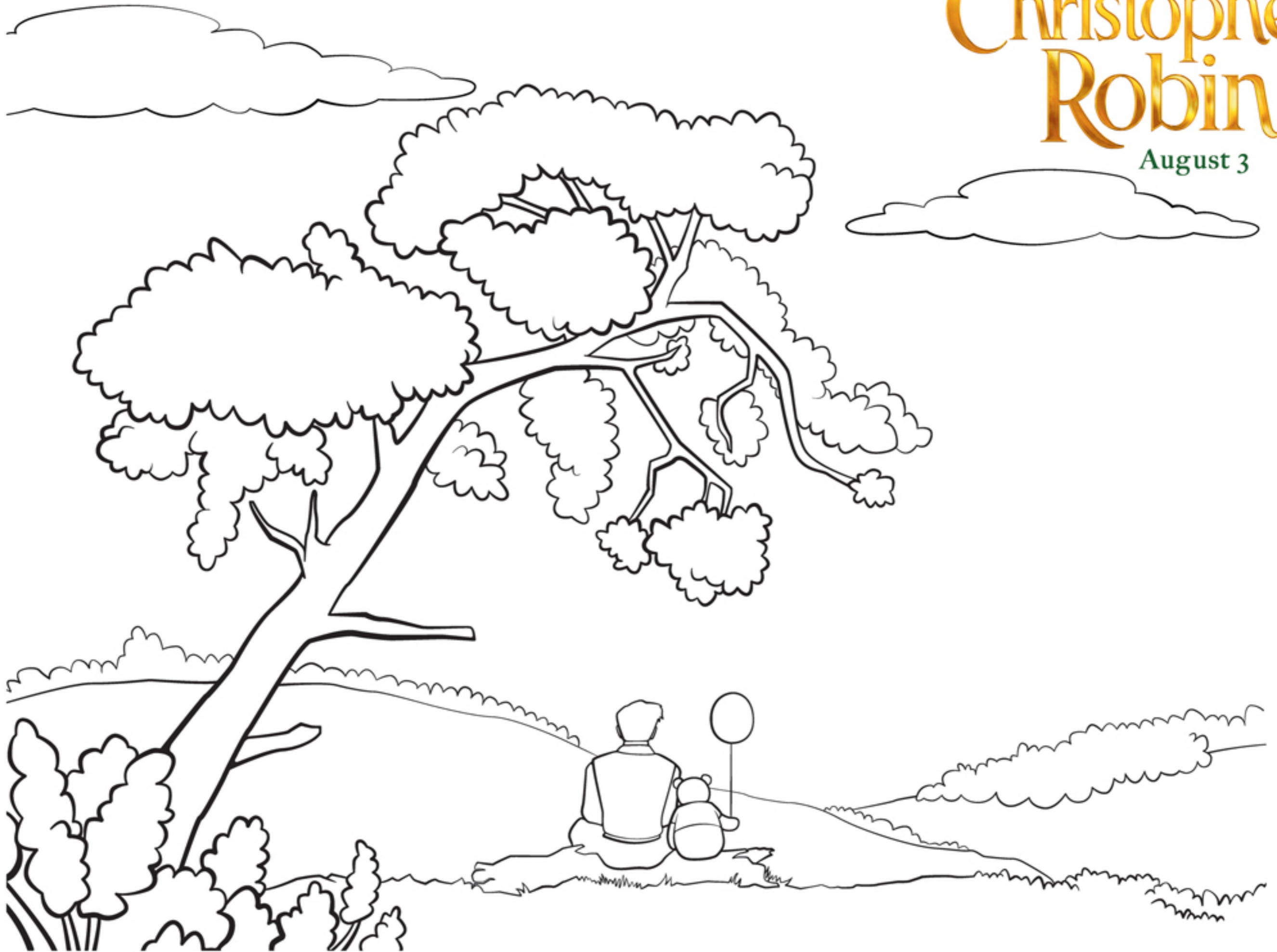
Christopher Robin and Pooh enjoy another sunset together.